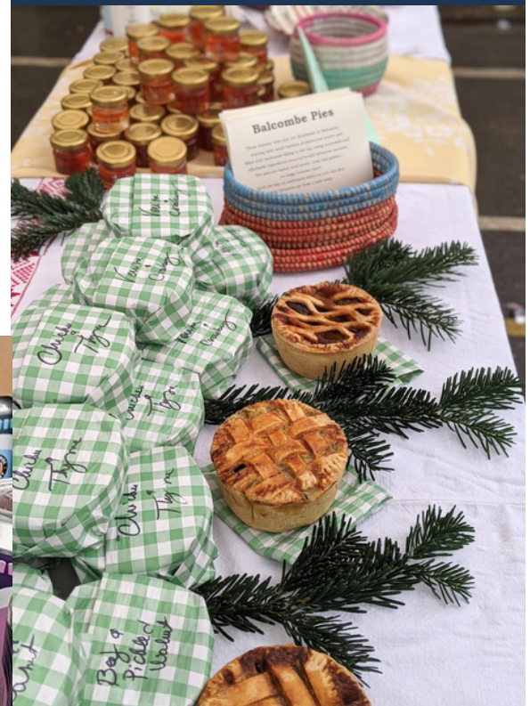
Some of our wonderful stall holders at the Christmas Fair. The Balcombe Pie Kitchen above and The Balcombe Brewery to the left.