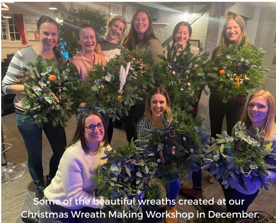
Some of the beautiful wreaths created at our Christmas Wreath Making Workshop in December.

Simply search for 'friends of balcombe school' to find us and be kept up to date with exciting village events!