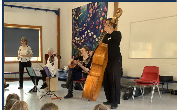
Music Discovery Workshop - Ensemble Reza sponsored by FoBS