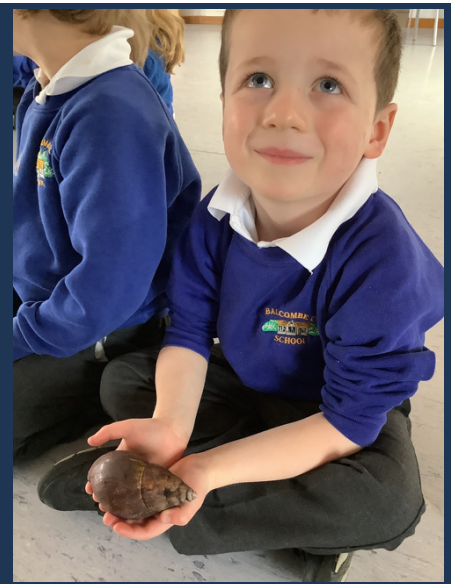
Zoo Labs visit sponsored by FoBS