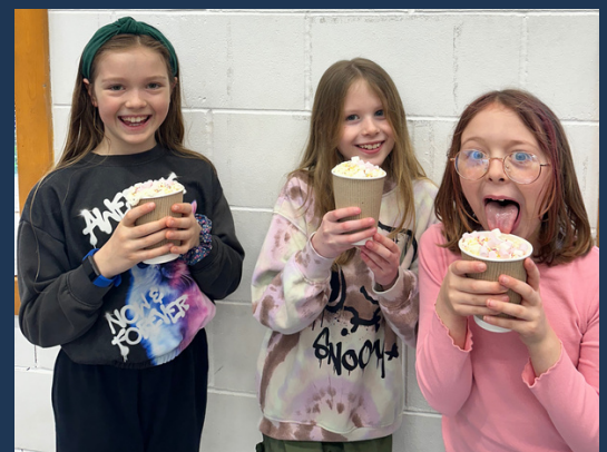
Loaded Hot Chocolates at the Balcombe Bull Run

Come to our AGM - details will be published on our social media pages.